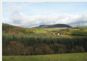
Views over Bryn Mawr

At the last stile leave the defined track crossing into the field heading towards the field gate at the bottom right hand side of the field. Pass through