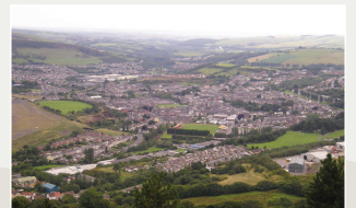
The Llynfi Valley

Pass through the gate and turn right. Follow the hedge line to the field corner and a stile. Climb over the stile and head towards the bottom left hand corner of the field and exit through a field gate onto the Maesteg road. Cross the road and turn left heading towards Cwmfelin School. Continue along the road and at the Y junction bear right keeping to the footpath into Mill Street and onto Garth Station.