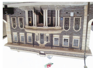
Maesteg Council Offices

Follow the Countryside Code wherever you go. You will get the best out of the countryside and help to maintain it now and for the future.