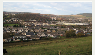
Views over Cwmfelin

To continue the walk leave the village past the monument and the church taking care in the narrow lane. At the T junction by the graveyard of the church turn right and head down the hill. On the left hand side after 400 metres look for a kissing gate in the hedge with a public right of way sign.