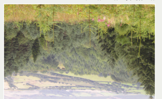
Mynydd Bach from Margam Mountain

For further information about this walk, to pass on your comments and suggestions or to report any practical problems on any of the paths please contact the Rights of Way Section, Communities Directorate, Morien House Bennett Street, Bridgend Industrial Estate, Bridgend, CF31 3SH (Telephone 01656 642553 or 01656 642593 ) or by e-mail at rights@way@bridgend.gov.uk